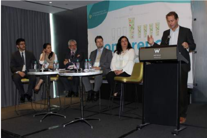
Conference on Biodiversity, Innovation and Business: Opportunities and New Rules for the Private Sector - Mexico 17 November 2015