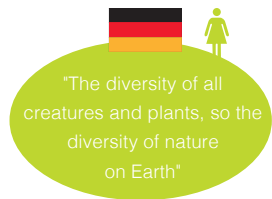
UEBT Biodiversity Barometer - Biodiversity awareness around the world - IPSOS survey