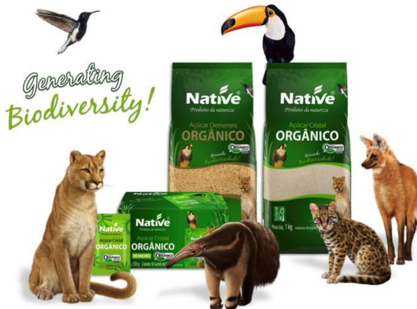
Native's marketing campaign "Generating Biodiversity" was very successful in raising consumer awareness on biodiversity

In addition, the price of alcohol fuel is regulated by the government, which does not provide favorable market conditions for producers. Ethical BioTrade can therefore encourage this industry to think differently and put ethics on top of the agenda. This would motivate a reflection on more adequate compensation for farmers, as well as best practices in labor rights and environmental conservation, which would raise Brazil to the next level. In Brazil there are some initiatives in this direction, such as Fair Trade, but this is geared towards small producers. I recognize that it is important, but does not solve the problem of the sugarcane sector.