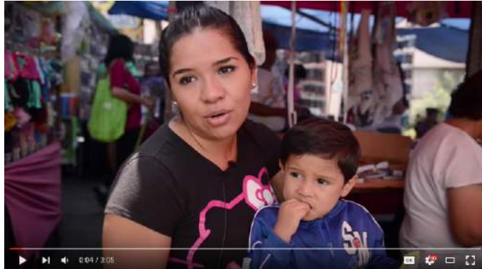
Click on the picture to access street interviews conducted for the Biodiversity Barometer in Mexico.

The project “Governance of biodiversity: Fair and equitable sharing of the benefits derived from the use and management of biological diversity” was launched in 2013. It is an initiative in the framework of the bilateral cooperation between Mexico and Germany. The project is implemented by the National Commission for Knowledge and Use of Biodiversity (CONABIO) and the Deutsche Gesellschaft für Internationale Zusammenarbeit (GIZ) GmbH, on behalf of the German Federal Ministry for Economic Cooperation and Development (BMZ). Its work will continue through 2017.