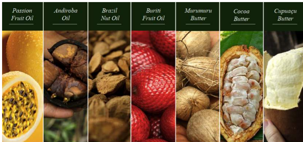
Symrise works with several native plant species coming from the North and North East of Brazil.

When I joined the UEBT Board, one of my key objectives was to raise the visibility of UEBT in the market. I offer my experience in the fragrance and flavor sector to provide strategic direction and to help UEBT grow, encouraging other companies in the sector join forces with us. For example, I believe the joint UEBT and Symrise projects are interesting initiatives that help raise the visibility of the organization.