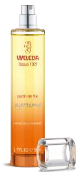
Sandalwood is used in Weleda's "Jardin de Vie - Agrume"

In Sri Lanka, Weleda has launched a project for organic and sustainable cultivation of sandalwood trees. The goal is to increase the number of sandalwood trees in Sri Lanka and to contribute to the livelihoods of local communities. Our partner in Sri Lanka runs a family-owned company. Part of the project, to which Weleda financially contributes, is to create a plant nursery and a training and education center for the collectors. This center focuses not only on sandalwood, but also on the cultivation of vegetables, tea and cinnamon trees. This is to conserve the variety of crops that are cultivated and eaten, as well as to expand and diversify local incomes. The local company now independently harvests and commercializes, with an organic certification.